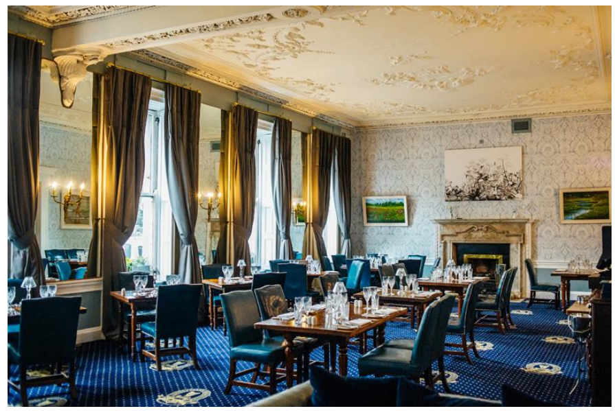
SATURDAY OCTOBER 20, 2018

"An unparalleled degree of comfort, refinement and privacy at the heart of Dublin since 1840"